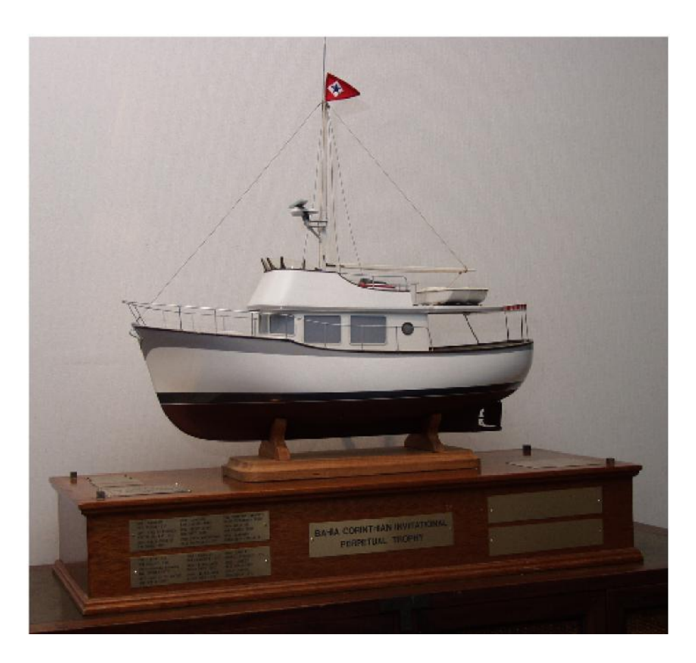
Bahia Corinthian Yacht Club Invitational Trophy