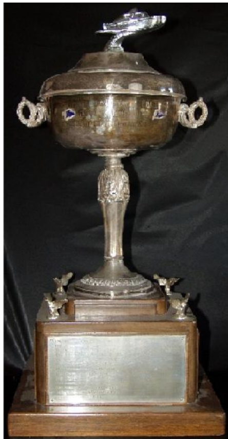
SHARKIE PERPETUAL TROPHY