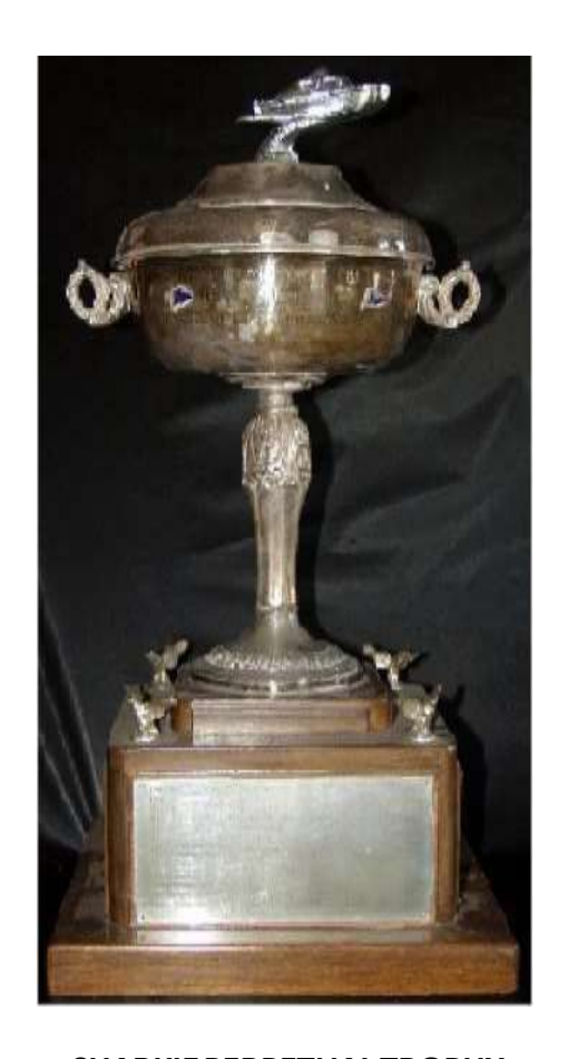
SHARKIE PERPETUAL TROPHY