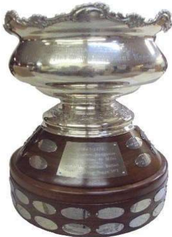
DEL MAR PERPETUAL TROPHY

AUGUST 7 or 8, 2025 SHIP ROCK TO CATALINA HARBOR