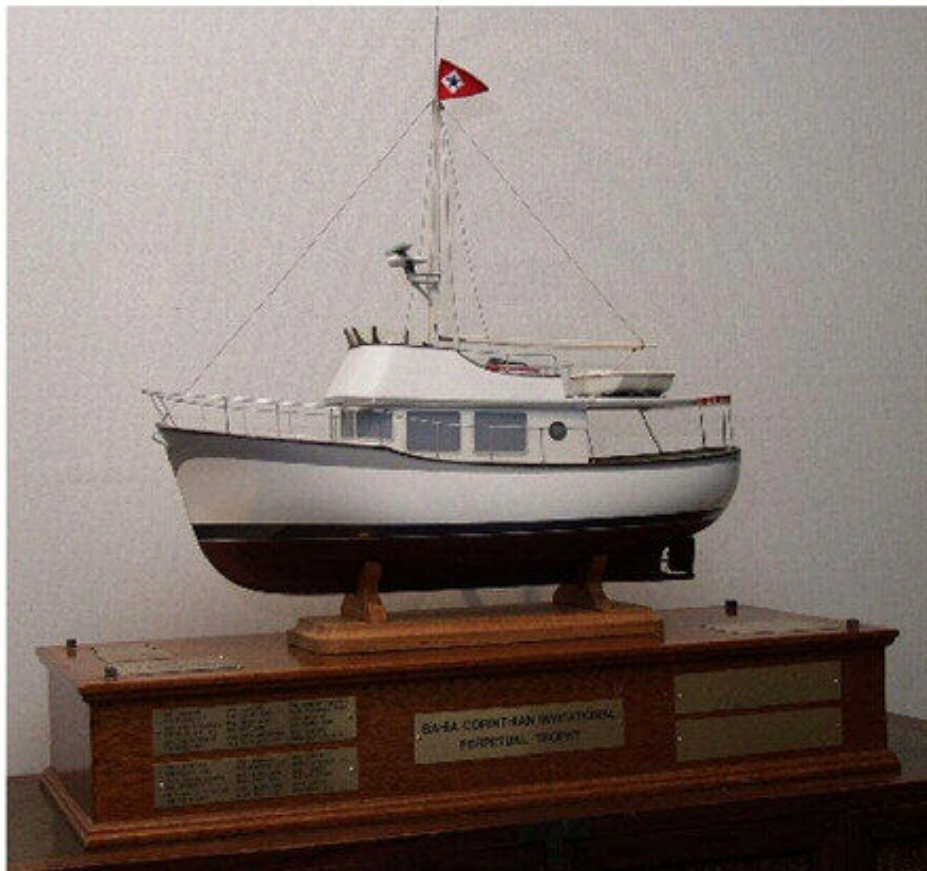
Bahia Corinthian Yacht Club Invitational Trophy