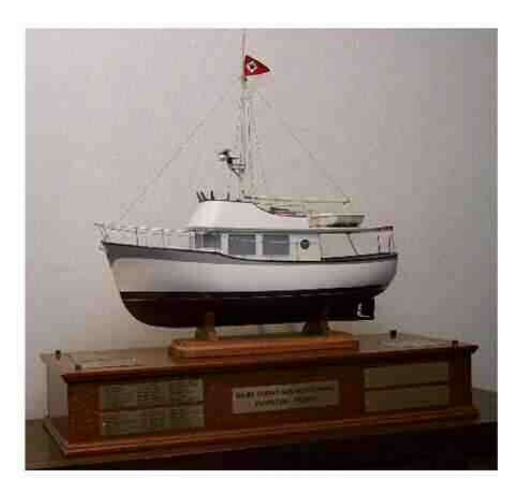
Bahia Corinthian Yacht Club Invitational Trophy