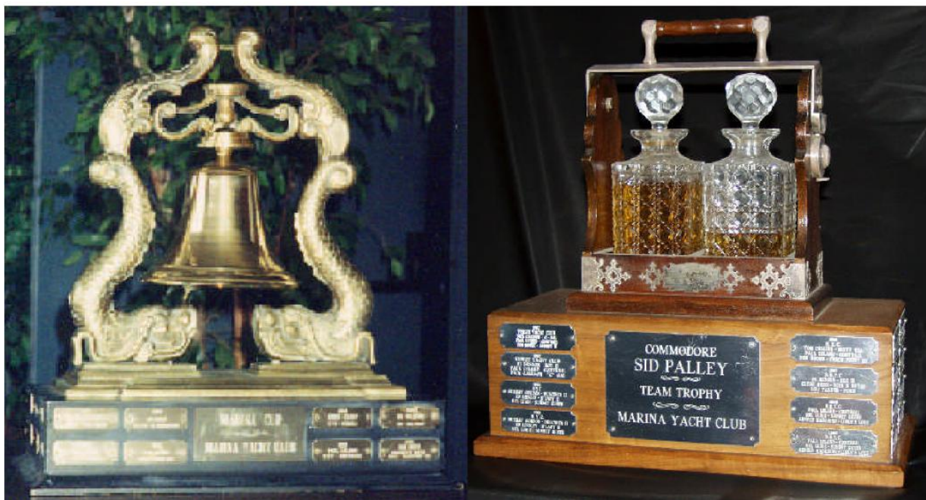
MARINA CUP TROPHY