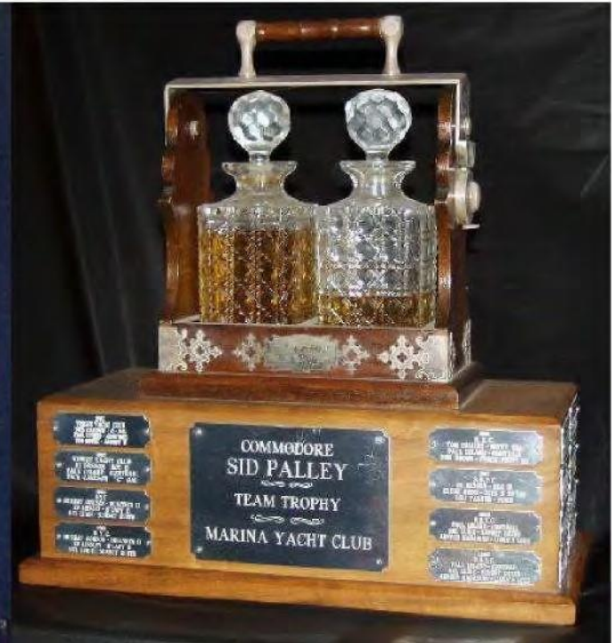
SID PALLEY TEAM TROPHY