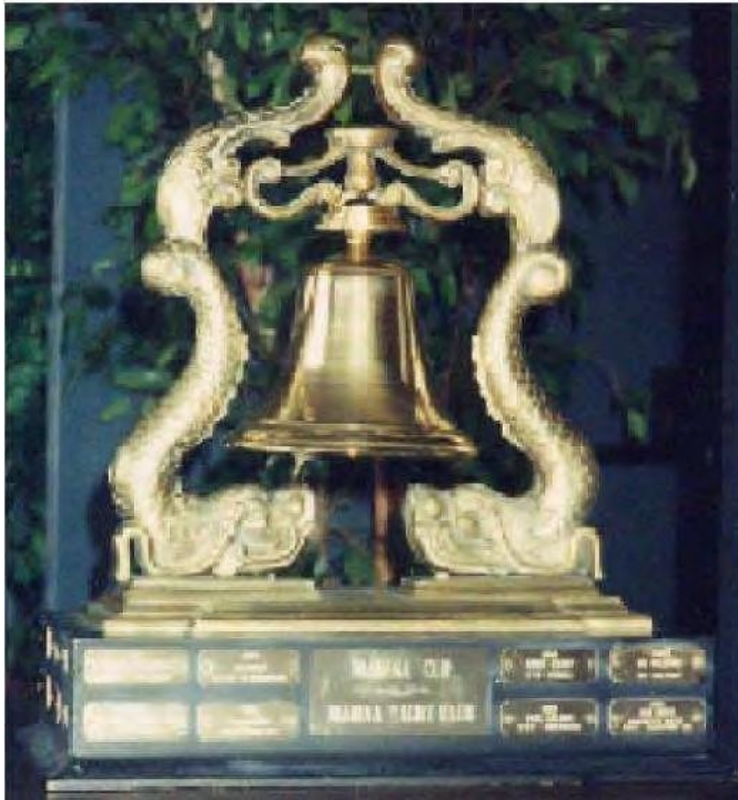
MARINA CUP TROPHY